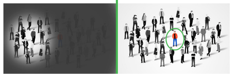
Figure 3 Raising social mobility to the Western European average could increase GDP by over 2%