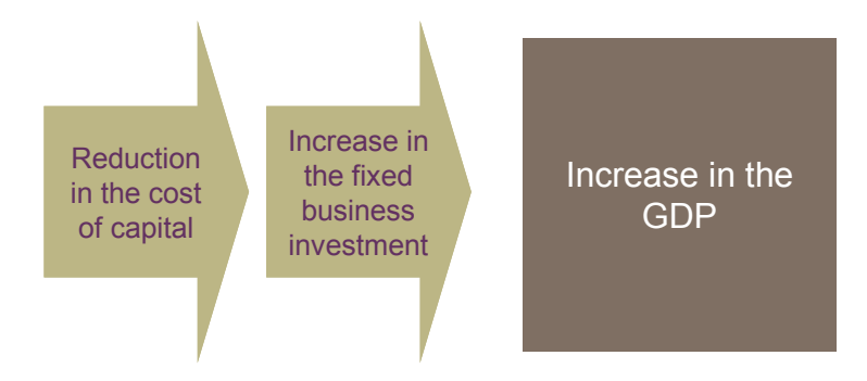
Figure 6.1 The impact of stamp duty

First, abolition of stamp duty would result in a reduction in the cost of capital of UK listed companies. Analysis in section 3 above summarises the results of the assessment of the reduction in the cost of capital of UK listed companies that would be likely to arise in the case of stamp duty abolition. Second, a reduction in the cost of capital of UK listed companies would be likely to result in increased fixed business investment. The evidence on the likely increases in the fixed business investment in the UK as a result of the stamp duty abolition is summarised in section 4. Third, an increase in the fixed business investment would be likely to result in an increase in the level of GDP in the UK. Finally, higher GDP would result in a higher tax-take by the UK government.