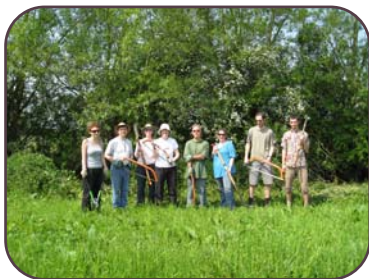
Oxera staff take part in conservation work for a local wildlife trust.

Oxera is a growing company and the work environment is dynamic, cooperative and friendly. Our workforce is truly international—between us we speak 23 languages—and we encourage cross-team collaboration to broaden everyone's experience. Our senior managers are approachable and always ready to listen to your ideas.