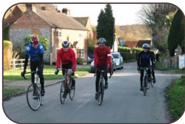
Oxera staff take part in a charity bike ride from London to Oxford.

We can promise you that working at Oxera will stimulate your intellectual curiosity and motivate you to come into the office each day. Outside work, our staff also find time to relax together in a variety of social and sporting activities.