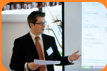
One of our Economics courses.

We will also do our best to accommodate a member of staff who wishes to pursue further studies by, for example, negotiating a year out or an arrangement for part-time or vacation work.